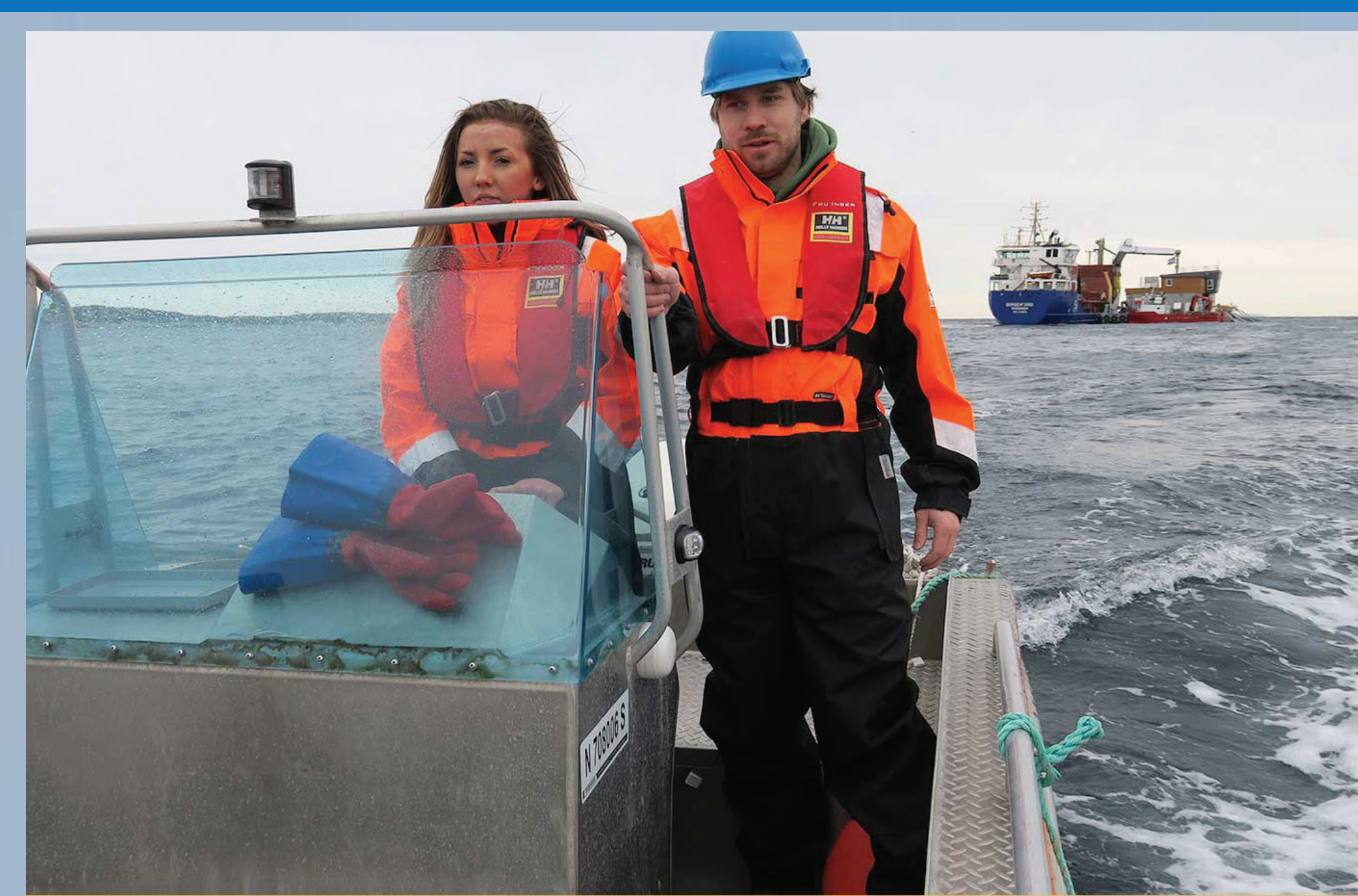
VOCATIONAL EDUCATION AND TRAINING PROVIDERS