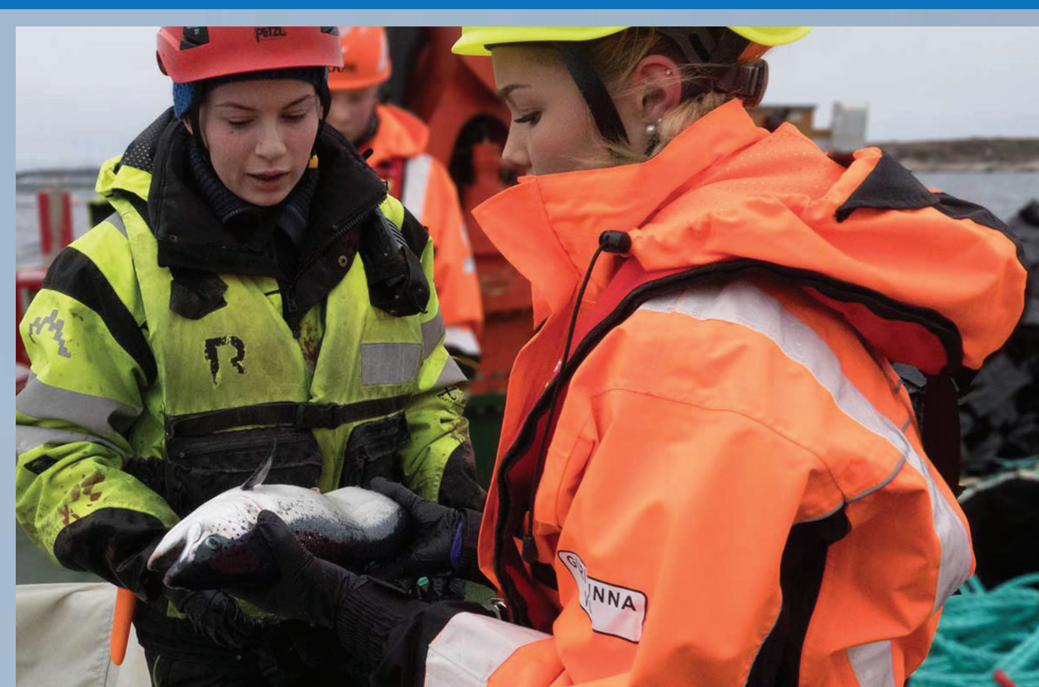
FISH PRODUCTION AND PROCESSING INDUSTRY