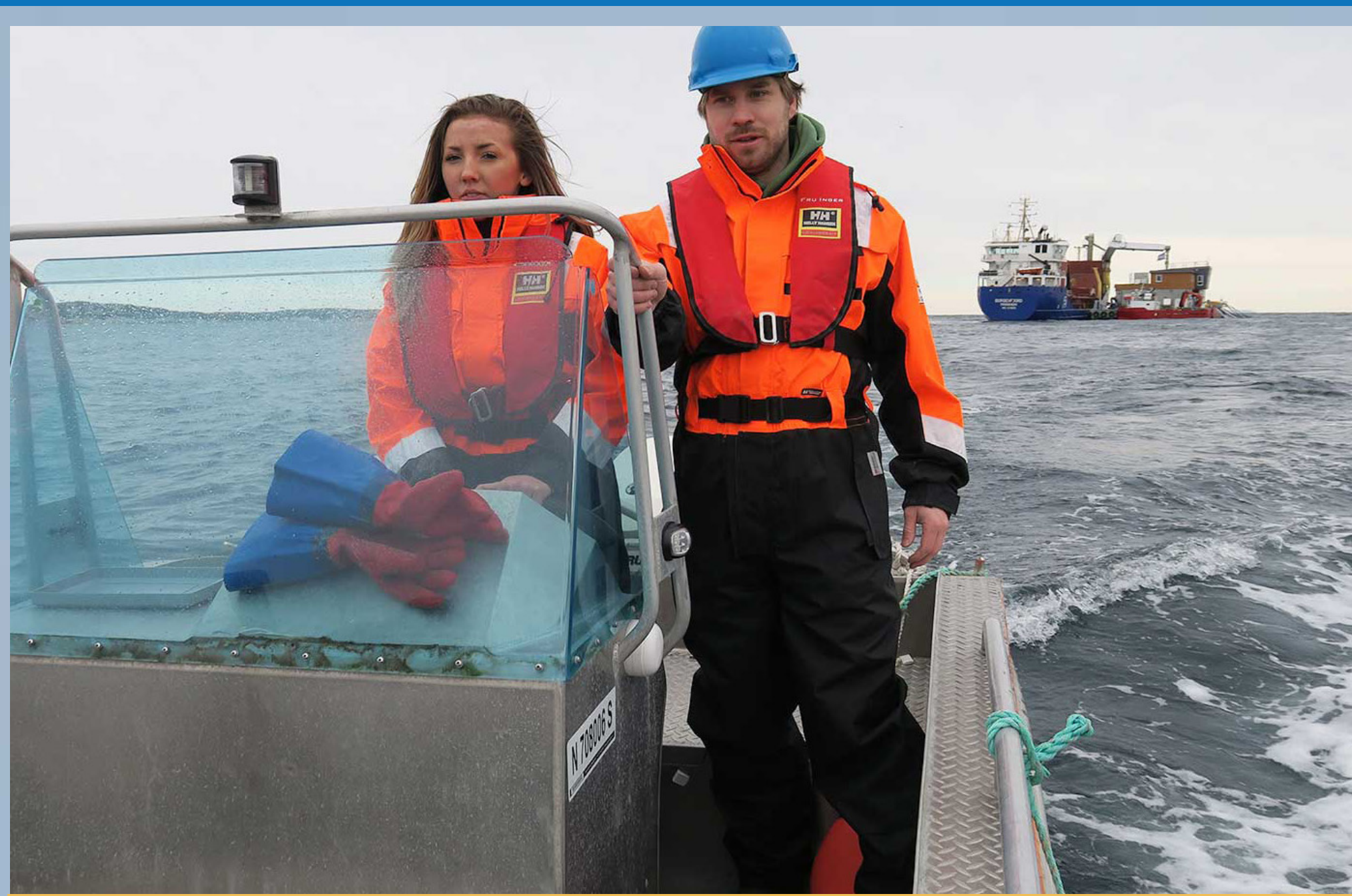
VOCATIONAL EDUCATION AND TRAINING PROVIDERS