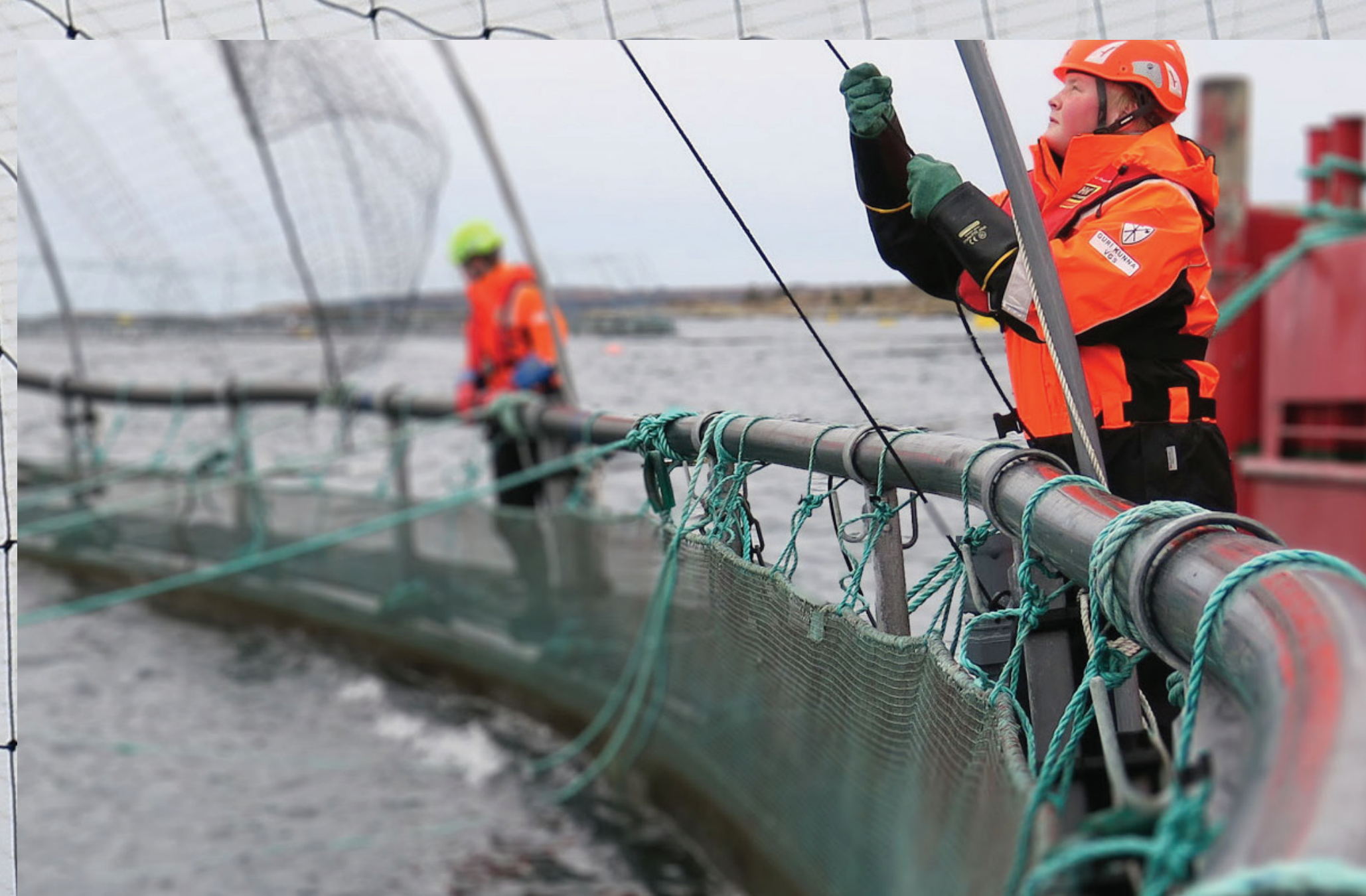
FISH PRODUCTION AND PROCESSING INDUSTRY