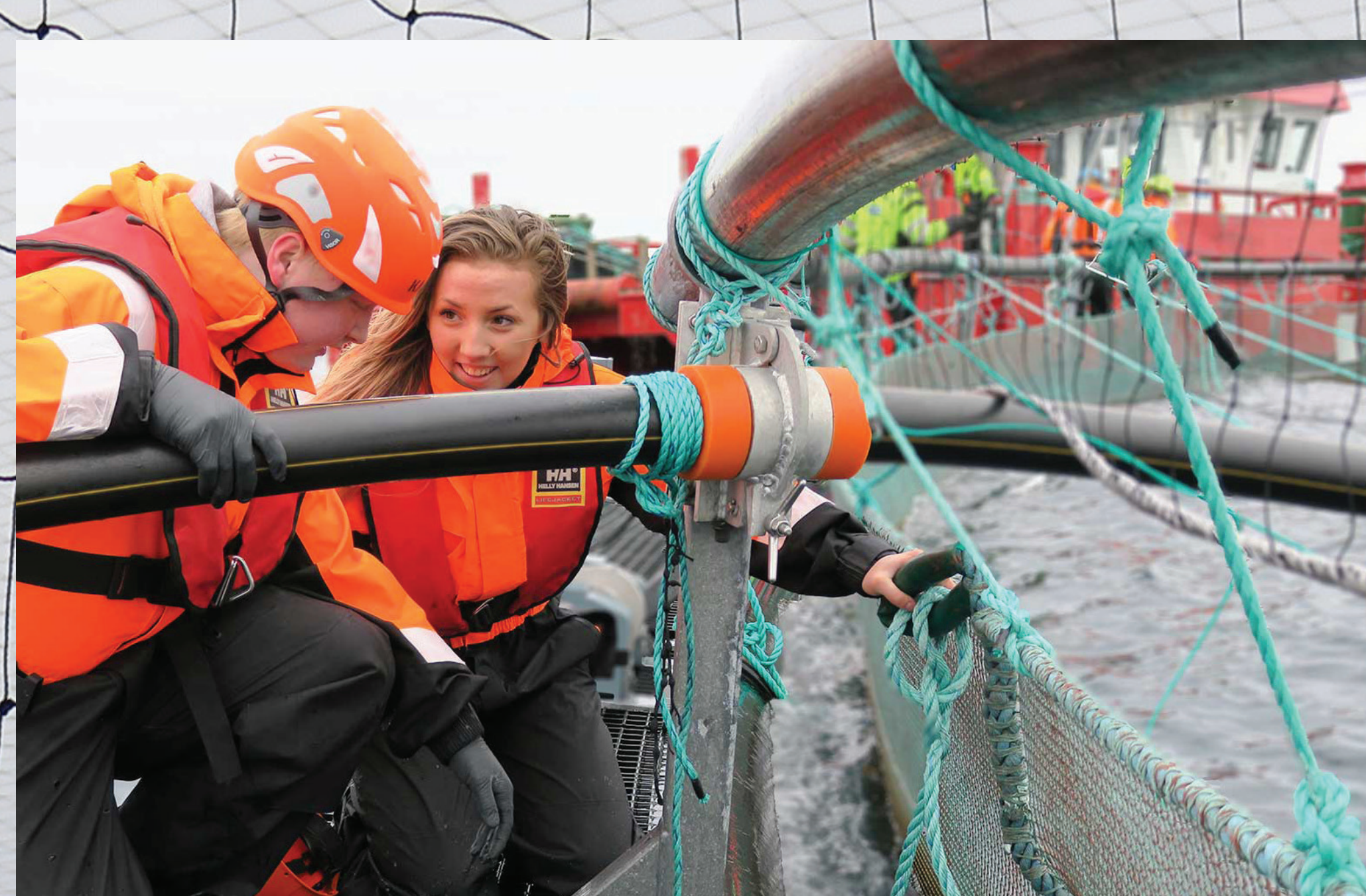
VOCATIONAL EDUCATION AND TRAINING PROVIDERS