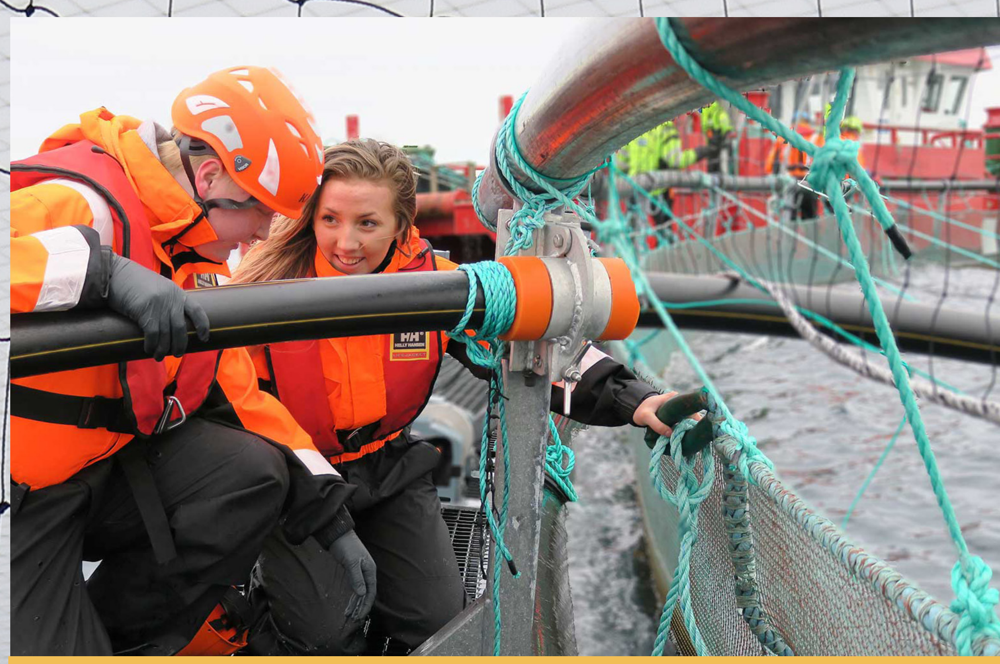
VOCATIONAL EDUCATION AND TRAINING PROVIDERS