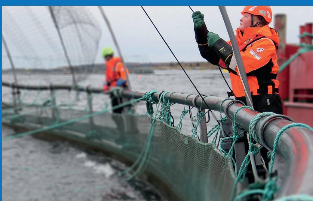
FISH PRODUCTION AND PROCESSING INDUSTRY