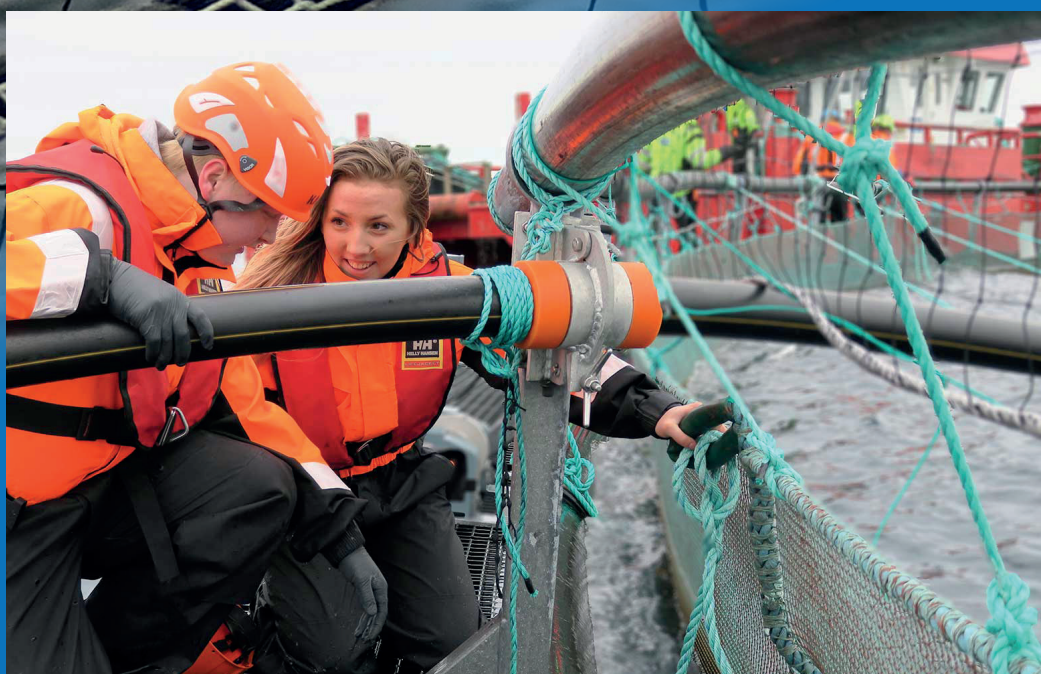
VOCATIONAL EDUCATION AND TRAINING PROVIDERS